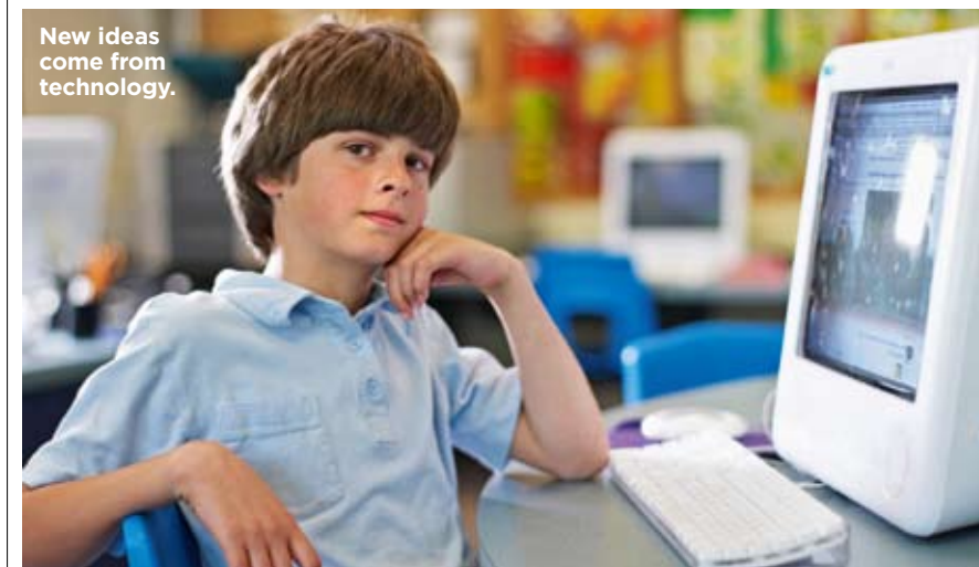
New ideas come from technology.

Email: nutrition@listener.co.nz , or write to "Nutrition", c/o Listener, PO Box 90783, Victoria Street West, Auckland.